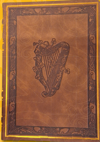
LJHB - Brown Harp Journal LPHB - Brown Harp Notebook