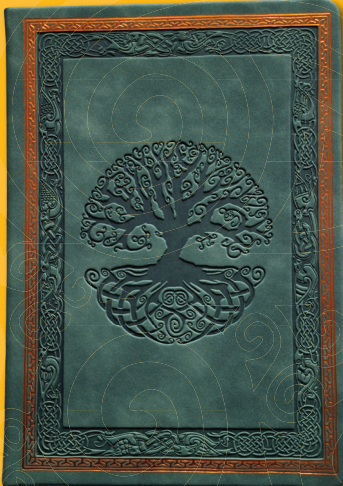
LJTG - Green TOL Journal LPTG - Green TOL Notebook