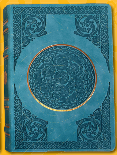
LJST - Teal Spiral Journal LPST - Teal Spiral Notebook