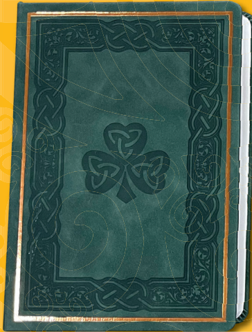
LJCG - Green Shamrock Journal LPCG - Green Shamrock Notebook