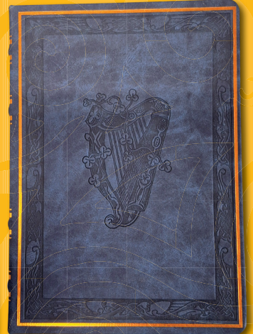
LJHN - Navy Harp Journal LPHN - Navy Harp Notebook