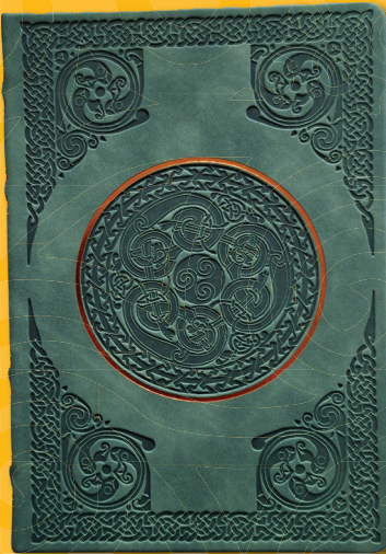
LJSG - Green Spiral Journal LPSG - Green Spiral Notebook