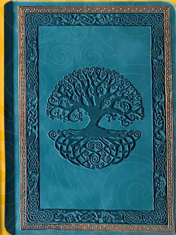
LJTT - Teal TOL Journal LPTT - Teal TOL Notebook