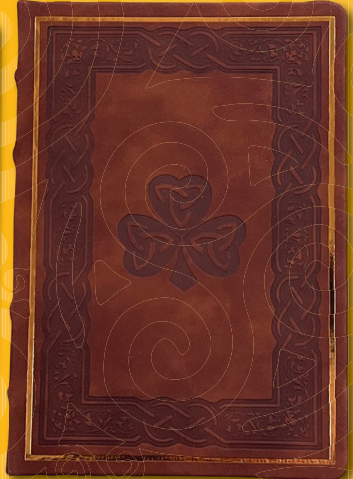
LJCB - Brown Shamrock Journal LPCB - Brown Shamrock Notebook