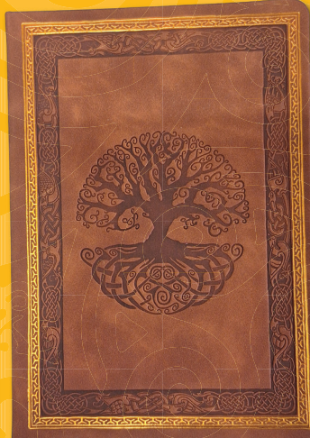
LJTB - Brown TOL Journal LPTB - Brown TOL Notebook