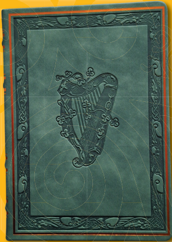
LJHG - Green Harp Journal LPHG - Green Harp Notebook