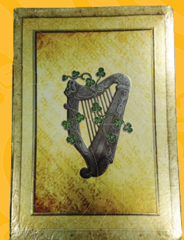
CPS05 - CJL05