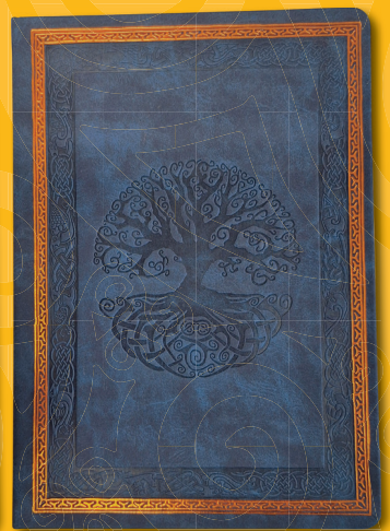
LJTN - Navy TOL Journal LPTN - Navy TOL Notebook