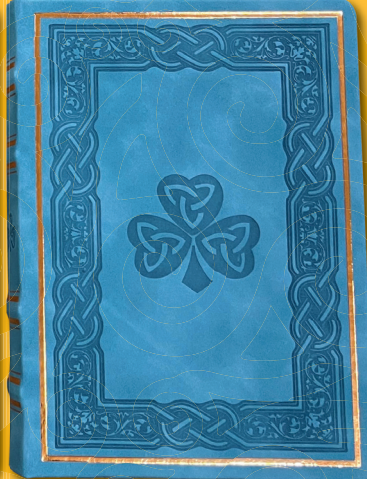
LJCT - Teal Shamrock Journal LPCT - Teal Shamrock Notebook