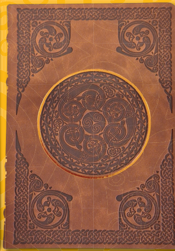
LJSB - Brown Spiral Journal LPSB - Brown Spiral Notebook