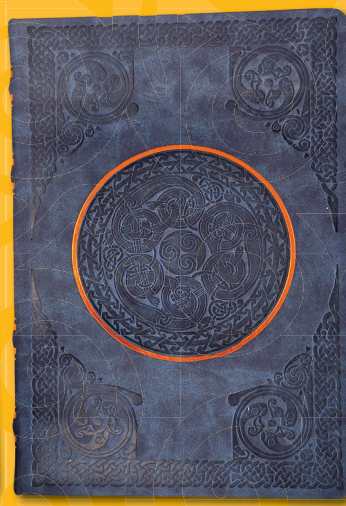
LJSN - Navy Spiral Journal LPSN - Navy Spiral Notebook