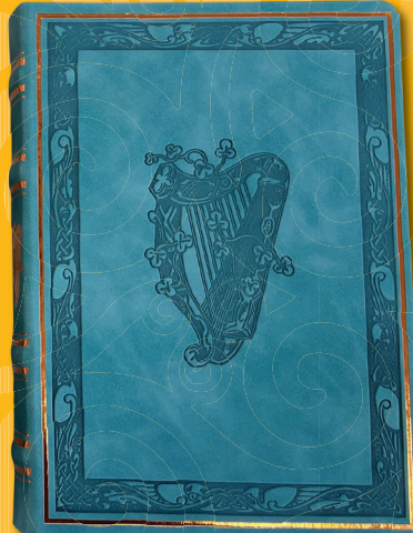
LJHT - Teal Harp Journal LPHT - Teal Harp Notebook